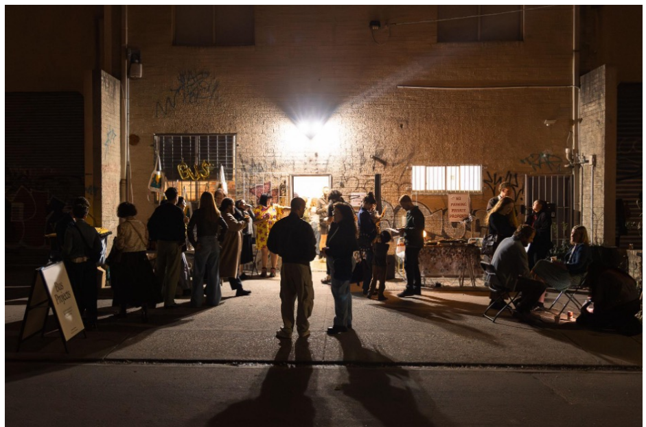
'Bus Stop', Bus Projects 2024 Fundraiser exhibition opening.

Since 2023, we have been located in a stand-alone gallery space in Brunswick East. We operate as a not-for-profit organisation with two part-time employees, an artist committee, and a volunteer board.