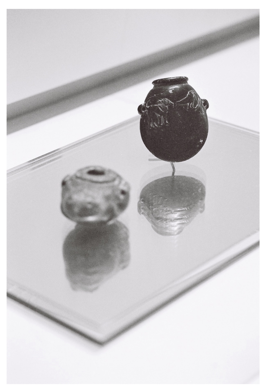
Angled Regard (detail), black and white film photograph, 2014